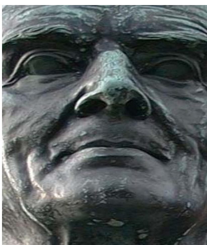
Samueal Hahenmaann from a bust on his grave at the Pere Lachaise Cemetary in Paris